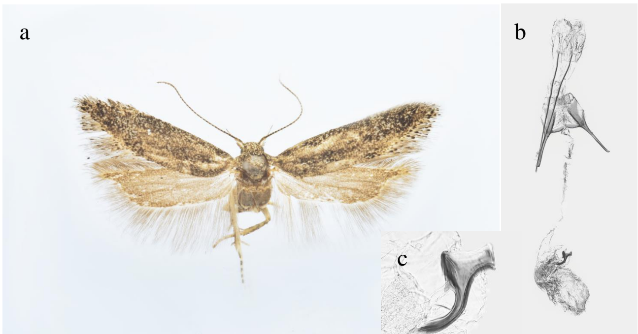
Fig. 8. Scrobipalpa chrysanthemella : a – adult female, b – female genitalia, c - signum

Locality: Połonina Caryńska (FV14), 1♀, 22.06.2021 leg. F. Paluch (Fig. 8).