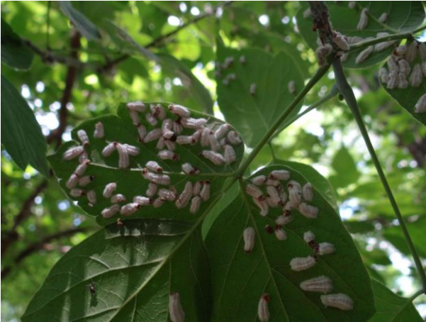
Fig. 1. Pulvinaria hydrangeae , adult females with ovisacs on the leaves of a maple tree. (Photo by P. Ceryngier).

the latter produces longer ovisacs with roughly parallel sides lacking shallow grooves present in P. hydrangeae (Fig. 2a, b). The other two Pulvinaria species ( P. vitis and P. regalis ) produce large, strongly convex ovisacs and oviposit on woody parts of their hosts, but P. vitis oviposits usually on smaller branches, while P. regalis prefers the trunk and main branches of its hosts (Fig. 2c, d).