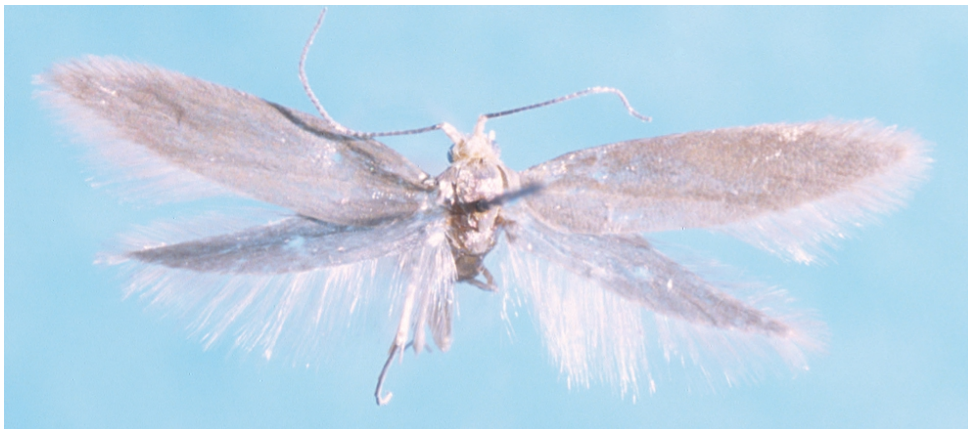
Fig. 1. Holotype of Argyresthia (B.) uralensis .

♂, same data as holotype. Genitalia slide: 03010202 (in coll. Jari Junnilainen, Vantaa, Finland).