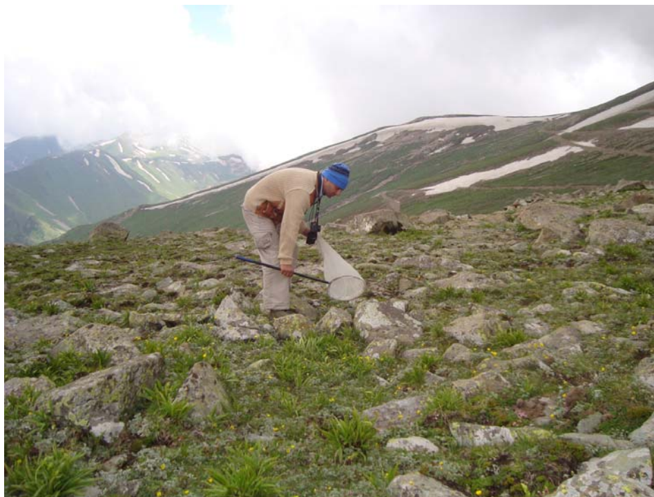
Fig. 6. Collection site of Limnephilus morsei sp. n.

Female genitalia (Figs 4-5). Segment IX apically rounded in lateral view. Segment X with appendage, bifid apically, one apical lobe finger-like and second upper lobe pointed. Subgenital plate median lobe pointed apically, lateral lobe nearly triangular.