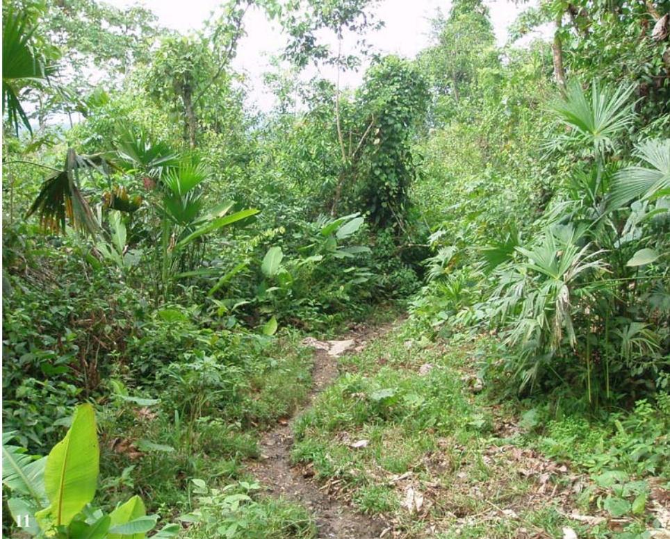
Fig. 11. Original habitat of the species: Archidona near Tena, Napo province, Ecuador, 570 m.

Egg (Figs 9, 10). Uniformly greyish brown. Capsule barrel-shaped, almost round in cross-section and 1.7-1.9x longer than wide; polar area slightly impressed. Entire surface of capsule with prominent, irregularly shaped impressions, which are densely and minutely granulose. The strongly raised interveining portions with longitudinally arranged wart-like humps. Micropylar plate almost circular in outline and about 1/4 the length of capsule; outer margin slightly raised. Micropylar cup very small and positioned posteromedially. Median line very indistinct. Operculum almost circular with a crown-like raised structure in the centre.