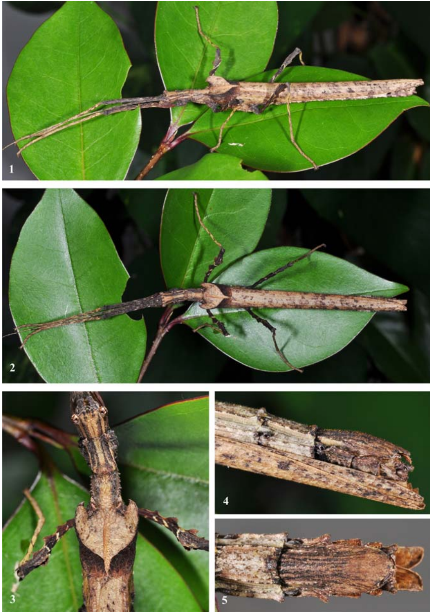
Figs 1-5. Pseudophasma lakini sp. n., female, paratype: 1 – dorsolateral aspect, 2 – dorsal aspect, 3 – close-up of head and thorax, showing the distinctive shape of the tegmina and femora, 4 – apex of abdomen in lateral aspect, 5 – apex of abdomen in ventral aspect.